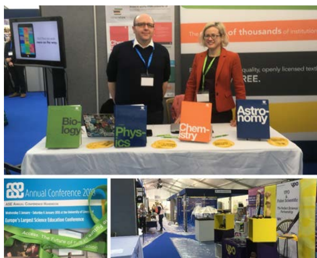
Image Credit: ASE Annual Conference 2018, Liverpool, UK (by Beck Pitt)