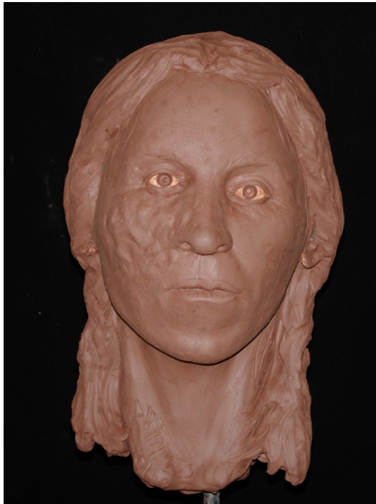
Figure 9.3: The facial depiction of the Wetwang Chariot Queen

condition, and if this woman had a haemangioma then it is possible that it was more severe than shown in the depiction. It may be that the mirror is a statement of her facial difference and if this interpretation is correct then this provides an interesting insight into the status of people with facial disfigurement in ancient populations, and disagrees with previous theories linking disfigurement with loss of status and exclusion. 80 In this case her high status could have trumped her facial disfigurement, or it may be that ancient populations were more tolerant and empathetic to facial disfigurement than previously thought.