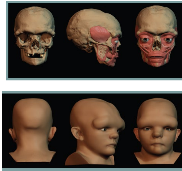
Figure 9.2: The facial depiction of the skull from the Surgeons' Hall Museum, Edinburgh (after Davison, 2012)

Some osteological assessments of craniofacial disease in archaeological investigations have been controversial, and this controversy may demonstrate our discomfort with the interpretation of facial disfigurement in ancient populations. One such example is the chariot burial excavation in 2001 funded by English Heritage in Wetwang, East Yorkshire. 66 The excavation uncovered the grave of an Iron Age chief, who was buried alongside her richly decorated chariot in the fourth century BC. 67 The aristocratic Celt was female, 35 to 45 years of age, 5 feet 9 inches tall and she may have had a facial disfigurement. She was laid in a crouched position, head to the south, on a mat or blanket at the southern end of the grave