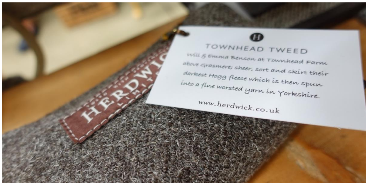
Figure 4: Townhead Tweed by Herdwick Limited

Located in Near Sawrey, a small village in south Cumbria, Herdwick Limited produces bags and accessories made from tweed. Based in Castle Cottage, the former home of Beatrix Potter, the sole proprietor Mandy lives as the custodian for the National Trust. Mandy purchased some Herdwick tweed fabric to re-upholster a window seat in the cottage, but ran out and set out on a journey to make her own fabric which she would use for bags and accessories.