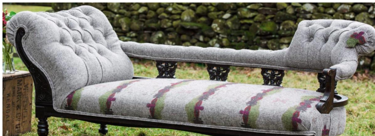
Figure 2: Re-upholstered chaise longue by Cable and Blake

This company, run by two friends, is located in Kendal, a small market town in the southern part of the county of Cumbria. The town has a rich history associated with the wool trade and has the motto “ Wool is my bread ”. The owners of Cable and Blake work part-time in the enterprise from their small shop on the town’s main street. Their fabric is designed in-house using the local landscape as inspiration for colour palettes and abstract patterns.