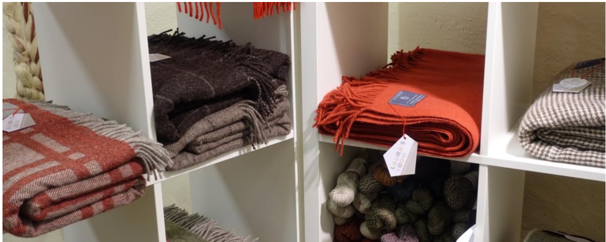
Figure 3: Woven products by Laura's Loom