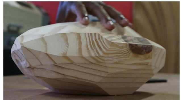
Figure 5: Two part CNC milled prototype in Medellin

For the sound generation part of the instrument, a different approach closer to algorithmic composition has been explored and produced higher level of musical material. A number of short musical phrases were composed or generated algorithmically, which could be repeated and triggered interactively by the performers. Each face of the polyhedron triggered a different phrase randomly or in a pre-defined order. Musical parameters of the phrase such as its tempo and dynamics were mapped to the orientation of body. The performers could articulate the phrases, control how many times they are repeated and when they will start playing. This procedure was inspired by In C by Terry Riley.