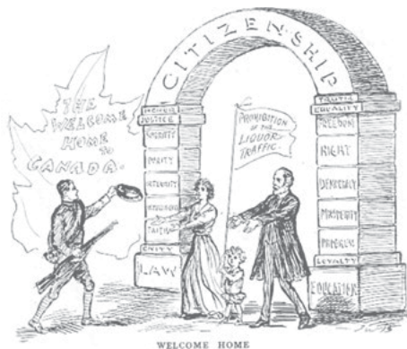
Temperance Lessons Quarterly (London, Canada: Dominion WCTU, 1918)

Aside from the relative ineffectiveness of the Liquor Act, temperance was initially legitimized as a war-time measure. The WCTU promoted temperance as a means of keeping the home front a safe and wholesome place that the men would be proud to return home to. A WCTU magazine published this cartoon, depicting this exact sentiment: