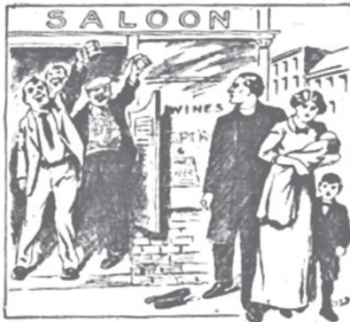
The High River Times , 1 July 1915,