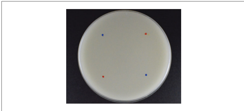
Figure 1 Oatmeal agar plates, marked with the points of inoculation. Blue for MAT1-1 and red for MAT1-2.