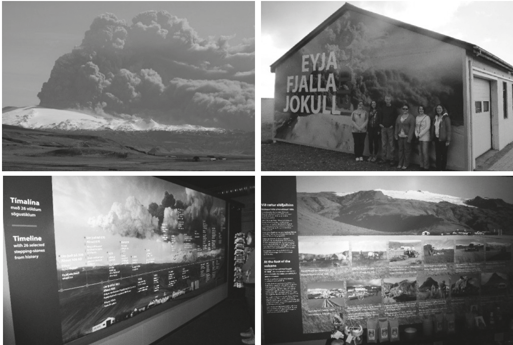
Figure 8 Eyjafjallajökull is a volcano completely covered by an ice cap in Iceland. When it erupted in 2010, it caused enormous disruption to air travel across western and northern Europe over an initial period of six days. At that time, it was dubbed “the volcano that stopped the world”. Since that time, it has become a major geotourism attraction which has spawned a local world class geo visitor centre.

Upper Left: Eyjafjallajökull in eruption in 2010. Upper Right: The Eyjafjallajökull Eldgos Visitor Centre started by the local farmer’s wife Guðný. Lower Left: The visitor centre has excellent geological interpretation throughout. Lower Right: It uses the geological knowledge to inform how living in the shadow of the volcano influences life in the region. Thus, it presents a more holistic geographic approach to geotourism which presents the relationships between its geological (Abiotic), plants and animals (Biotic) and how people live there today (Cultural) elements.