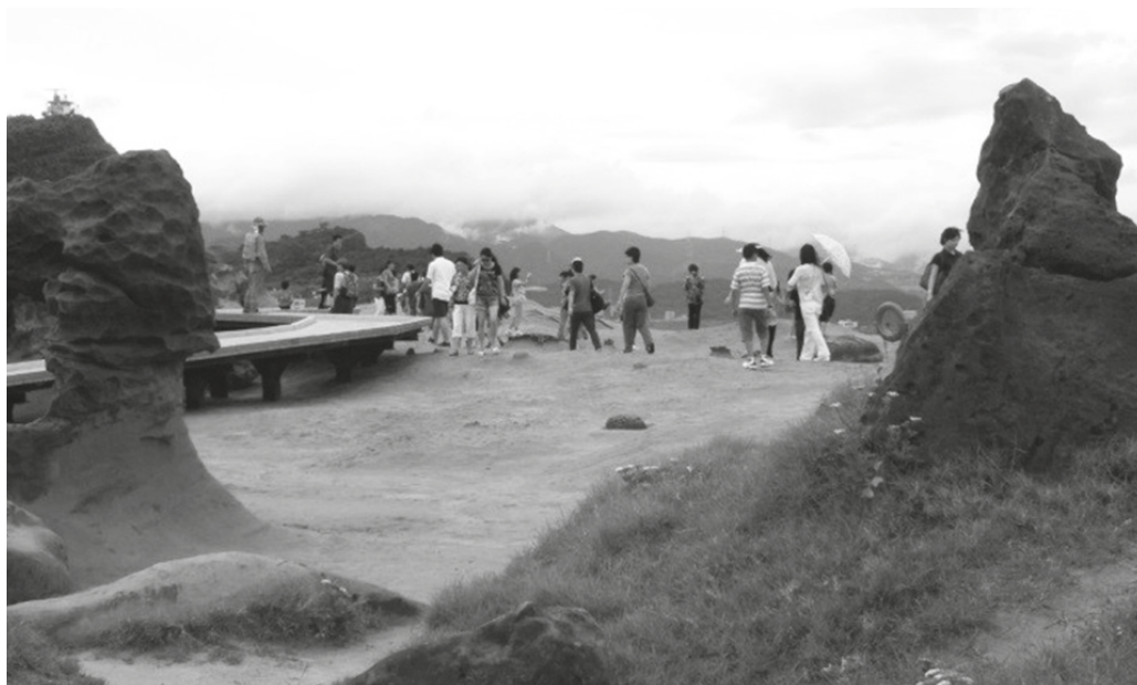
Figure 3 Where pathways and boardwalks are present, they do not contain visitors who tend to roam at random across the entire area of sandstone pinnacles. Overall, the capacity to manage this site even on moderately busy days is very limited and much of the park is not effectively managed in terms of public access to landforms with people crossing nominated restricted access zones. Yehliu Geopark, Taiwan.

Lessons learned from the study show that the management of a site can be ineffective and can even lead to a management footprint that carries a significant impact in its own right (Figure 3). Management actions have resulted in the development of hardened walkways, viewing platforms, installation of educational materials, life saving equipment points, a boardwalk, barriers, extensive signage, security camera points and signed restricted areas. The end result is an overdevelopment scenario, in the form of a substantial management footprint, which fails to contain and even adds to negative impacts on the natural values of the site (Newsome et al., 2013). The presence of wardens does not prevent visitors climbing over the landforms and with an estimated 10,000 visitors in a single day, the congestion results in people straying from paths, not using the boardwalk and not adhering to park regulation specified “no-go” areas. The case illustrates that when there are large numbers of tourists, it is extremely difficult to effectively manage them.