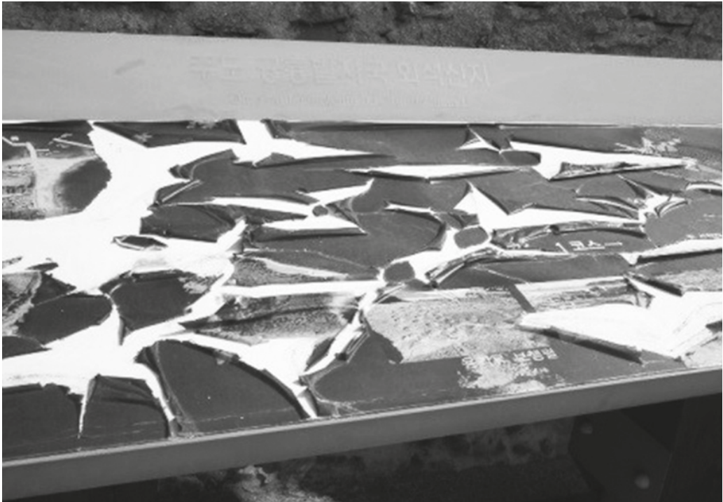
Figure 5 Dysfunctional interpretive panels located at high profile dinosaur fossil sites located in South Korea. Interpretive panels are only effective if there is adequate funding for the monitoring of weathering, storm damage and vandalism. Such situations can give visitors the impression of management neglect.