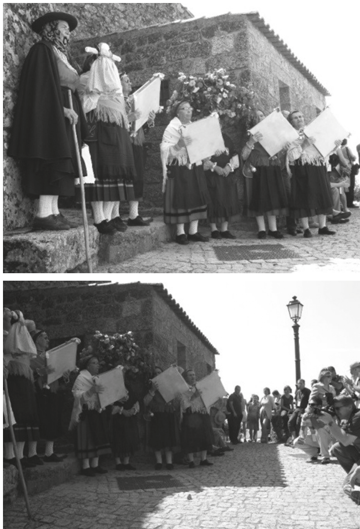
Figure 6 Naturtejo da Meseta Meridional UNESCO Global Geopark, Portugal is located in the centre of Portugal, near the border with Spain. Since its establishment in 2006, it has revitalised the interest of local people in their arts, crafts, music and culture. Here a group of local musicians and singers presents to an audience of participants from the 8th European Geoparks Conference in 2009.