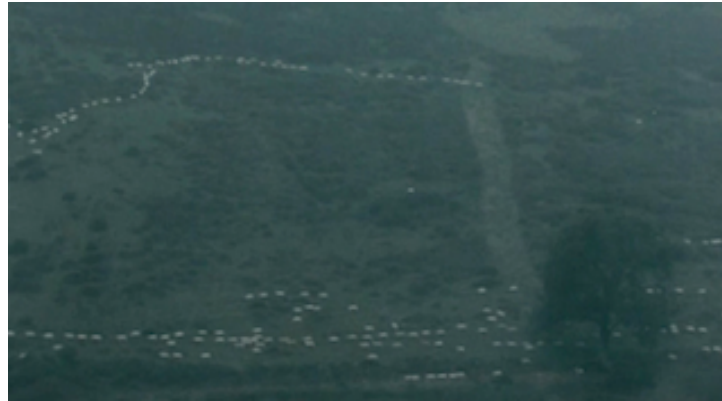
Figure 5. The sequence from sleep furiously (2008) described above, in which an affective engagement with the experience of the Welsh farming community’s disintegration is opened up (Koppel, 2008).

shows , to one that does ; a movement that works to open spectatorial engagements, where signification is curtailed and affect amplified” (p. 95). In this shift in the relationship between viewer and image, Daniels-Yeomans sees in this distant, protracted shot of sheep being herded down a hill, the potential for an “experiential engagement” with “the disorientating loss of collective narrative” associated with community traumatisation (p. 95).