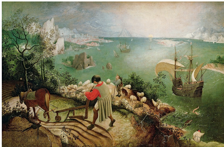
Figure 7. Pieter Breugel's Landscape With the Fall of Icarus (1560's), with Icarus' demise but a small event in the bottom right-hand corner of a much larger vision.