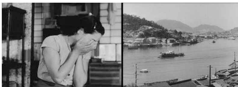
Figure 2. The sudden outburst of emotion seen in the “decisive action” (left) of Tokyo Story (Ozu, 1953), rather than be resolved, is incorporated into a static view (right); a “larger scheme” that reveals the “dual nature” of the film, in which “one understands that the transcendent is just beneath every realistic surface” (Schrader, 1972, para. 7&8).

The static view represents the “new” world in which the spiritual and the physical can coexist, still in tension and unresolved, but as part of a larger scheme in which all phenomena are more or less expressive of a larger reality – the Transcendent. (1988, p.83)