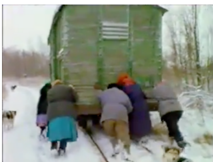
Figure 3. The long, arduous passage that opens Bread Day (Dvortsevov, 1998)..

as possible, but it is handheld, and follows from a respectful distance. What we see of the people pushing the carriage is mainly their backs as they labour on and discuss the task. It is a slow and patiently captured scene, in which time itself – the length of the task, the slowness of the progress – becomes central. In this slow process, the carriage takes on a real presence of its own, a focal point for the diffused representational engagement of the human event. An aesthetic engagement is thus aroused, although partially subsumed into the narrative, as the length of this sustained effort of pushing the carriage is still attached symbolically to the theme of futility and isolation.