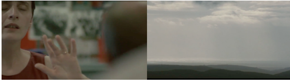
Figure 4. The two images being intercut within the same sequence in sleep furiously , as described above (Koppel, 2008).

The scenes presented in sleep furiously are mostly fragmentary, incomplete – rarely longer than a few minutes. And there is no discernible, governing shape of the film as a whole for this cutaway to landscape to appear in contrast to. It is consistent with the overall strategy of mixing the mostly descriptive with an aesthetic engagement, transforming the town, its people, and surrounding environment into a kind of lyrical, poetic reality. Rather than a film that recalls Frederick Wiseman, certain scenes recall Bresson; his fragmentary framing of a person or a place, leaving the space between things to take on its own resonance, and adding another perceivable ‘layer’ or dimension to the presentation. As Koppel explains, “It is not the manifest landscape I explore in my work – what is important is the latent and imaginary world evoked by what I experience around me” (Koppel, 2017, p. 182). The increased prominence Koppel has given to place and form, and the distancing strategies he employs, the long take in particular, creates the potential to make perceivable this “latent” film or subject.