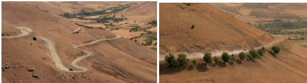
Figure 1. The two opening shots of The Wind Will Carry Us (Kiarostami, 1999).

Their conversation takes place in a rapid back and forth manner, in which they speak over the other, repeat themselves, laugh and disagree. The subsequent shots in the sequence are slow pans, still in an extreme long shot, which follows the car through the landscape, stopping at times to allow the car to leave the frame or disappear behind a hill.