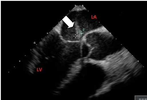
Figure 1. A transesophageal echo showed a 3.7 cm long mobile thrombus attached to the roof of the left atrium (arrow), LA: left atrium, LV: left ventricle.

A transesophageal echo on the following day showed an ejection fraction of 30% and a 3.7 cm long mobile thrombus attached to the roof of the left atrium (Figure 1). He also had recurrent episodes of atrial fibrillation during his hospital course.