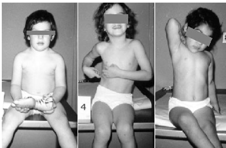
Figure 1. Body mass index Growth Grid Training Module pictures from left to right: an obese male child, a normal-weight female child, and an overweight female child. 14

Data analysis was completed using the Statistical Package for the Social Sciences (SPSS) version 15.0. Frequencies were computed for categorical data while means and standard deviations were computed for continuous data. Because age was not normally distributed, the median also was reported. For additional analysis, ANOVA was computed to assess total accuracy (sum of correct responses) by level of profession (student, resident physician, or physician) and chi square was used to compare accuracy regarding individual pictures with respondent's gender and confidence level. Due to the low number of respondents for the two extreme categories, the respondents who felt "very confident" were collapsed into "confident" and those who were "somewhat confident" were collapsed into "not confident" for the chi-square analyses to allow Fisher's Exact corrections.