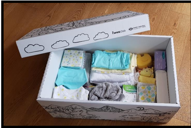
Figure 4: Scottish Baby Box

concerns have been raised (46) about the lack of any evidence that the boxes actually reduce the risk of SIDS, and that private box manufacturers have been promoted in England without oversight.