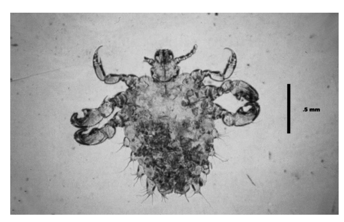
FIGURE 2. Pthirus pubis found in sediment and clothing associated with a mummified human body, Chiribaya Culture, Peru.

the European conquest. Pubic hairs were present in four mummies, and eggs were found attached to the pubic hair in 1 adult male mummy (Fig. 1). The attachment site, morphology, and egg size (1 mm) confirm the diagnosis of P. pubis .