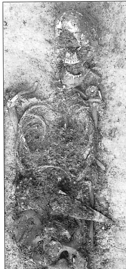
Fig. 2. The copper dagger found in tomb 64.