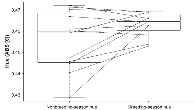
FIGURE 4. Early-molting male Red-backed Fairywrens ( n = 12 ) captured in both the nonbreeding and breeding seasons within a single year in Northern Territory, Australia, 2012–2014, increased in redness of back feathers between these 2 periods. Lines between points denote a paired comparison between the 2 time points for the same individual male. Values for plumage hue ( \theta ) have been converted to absolute values (ABS) for visualization purposes, such that a higher value denotes a redder hue.

initially developed red patches during the nonbreeding season that were equivalent to the back hue expressed by late-molting males in the breeding season (Wald chi-square test: \chi^2 = 0.36 , df = 1 , P = 0.55 ; early-molting males, nonbreeding season: n = 36 ; late-molting males, breeding season: n = 27 ) (Figure 3). However, early-molting males captured in both the nonbreeding and the breeding season ( n = 12 ) tended to increase in redness (i.e. hue) between the nonbreeding and the breeding season (paired t_{11} = 2.0 , P = 0.07 ; Figure 4). We recorded adventitious back molt for the majority (10 of 12) of these early-molting males during the breeding season, despite the fact that they completed the prenuptial molt months previously (Table 1). Most early-molting males converged upon a very red hue during the breeding season, such