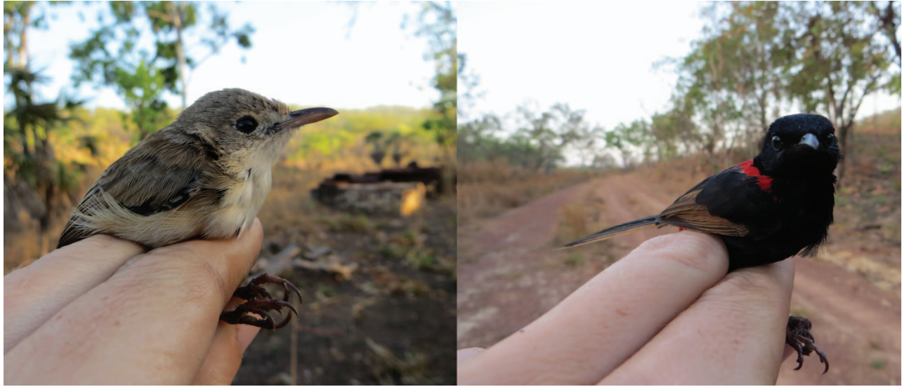
FIGURE 1. Male Red-backed Fairywrens in dull eclipse plumage (left) and nuptial red-black plumage (right). Following breeding, most males molt into dull eclipse plumage in the prebasic (postnuptial) molt. The prealternate (prenuptial) molt is asynchronous, such that some males display nuptial red-black plumage for months during nonbreeding periods, whereas others maintain eclipse plumage during the nonbreeding season and molt into red-black right before breeding.

total molt score of 18, the maximum value possible. We focus on back molt in the present study because of the importance of coloration of the red back feathers as a sexual signal, but we present values for total body molt as well, for completeness.