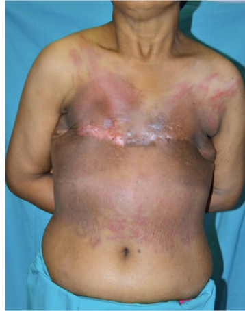
FIGURE 3: At three-month followup, the wound had fully settled with acceptable scar. The patient was offered breast reconstruction but declined.

surgery [9, 10]. As for the patient in our case, who has stage IIIB breast cancer, she opted for bilateral mastectomies with anterior chest wall reconstruction instead.