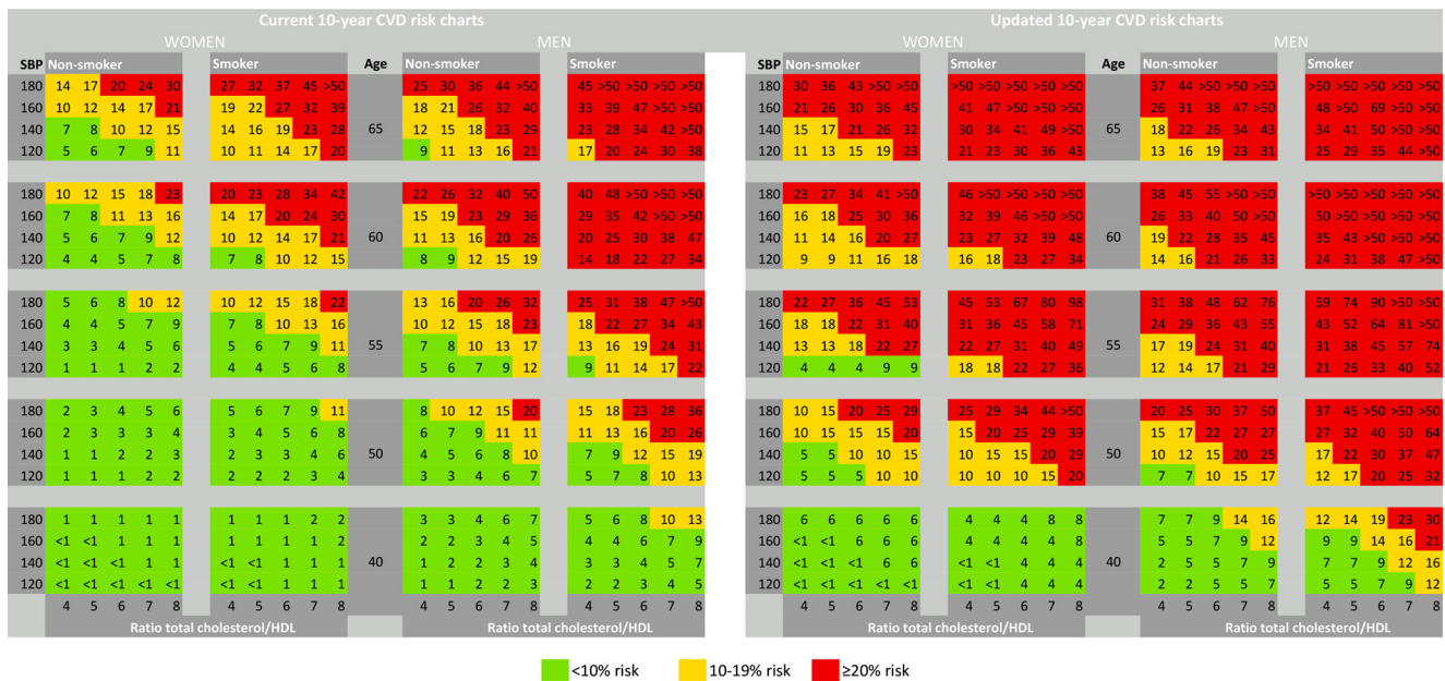
Fig. 1 Risk charts of 10-year risk of CVD (Left panel: 10-year risk of fatal CVD and nonfatal myocardial infarction, cerebrovascular disease, and congestive heart failure, as in the current Dutch preventive guidelines. Right panel: Updated risk chart for 10-year risk of clinically relevant CVD (any fatal or nonfatal CVD, including ischaemic heart disease, cerebrovascular accident, congestive heart failure, peripheral artery disease, and aortic aneurysm). Numbers are % 10-year risk. CVD cardiovascular disease)