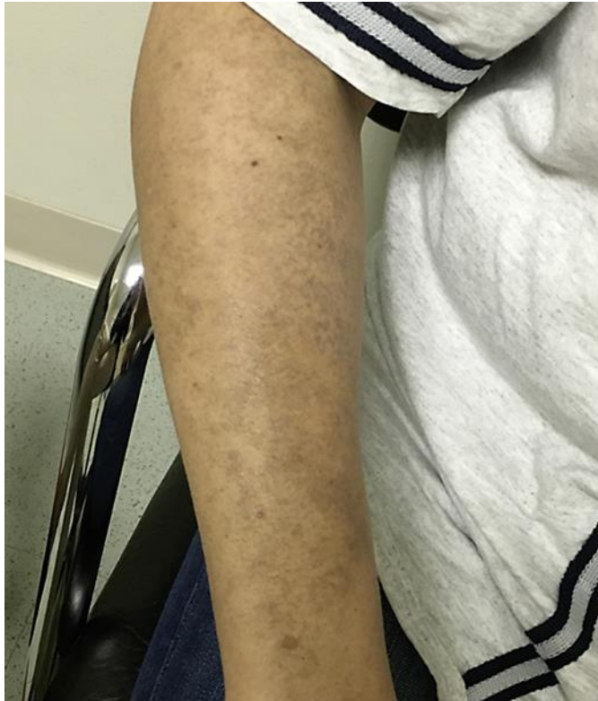
Fig. 2. Extensor surface of right arm demonstrating confluent violaceous lichenoid drug eruption and residual hyperpigmentation.