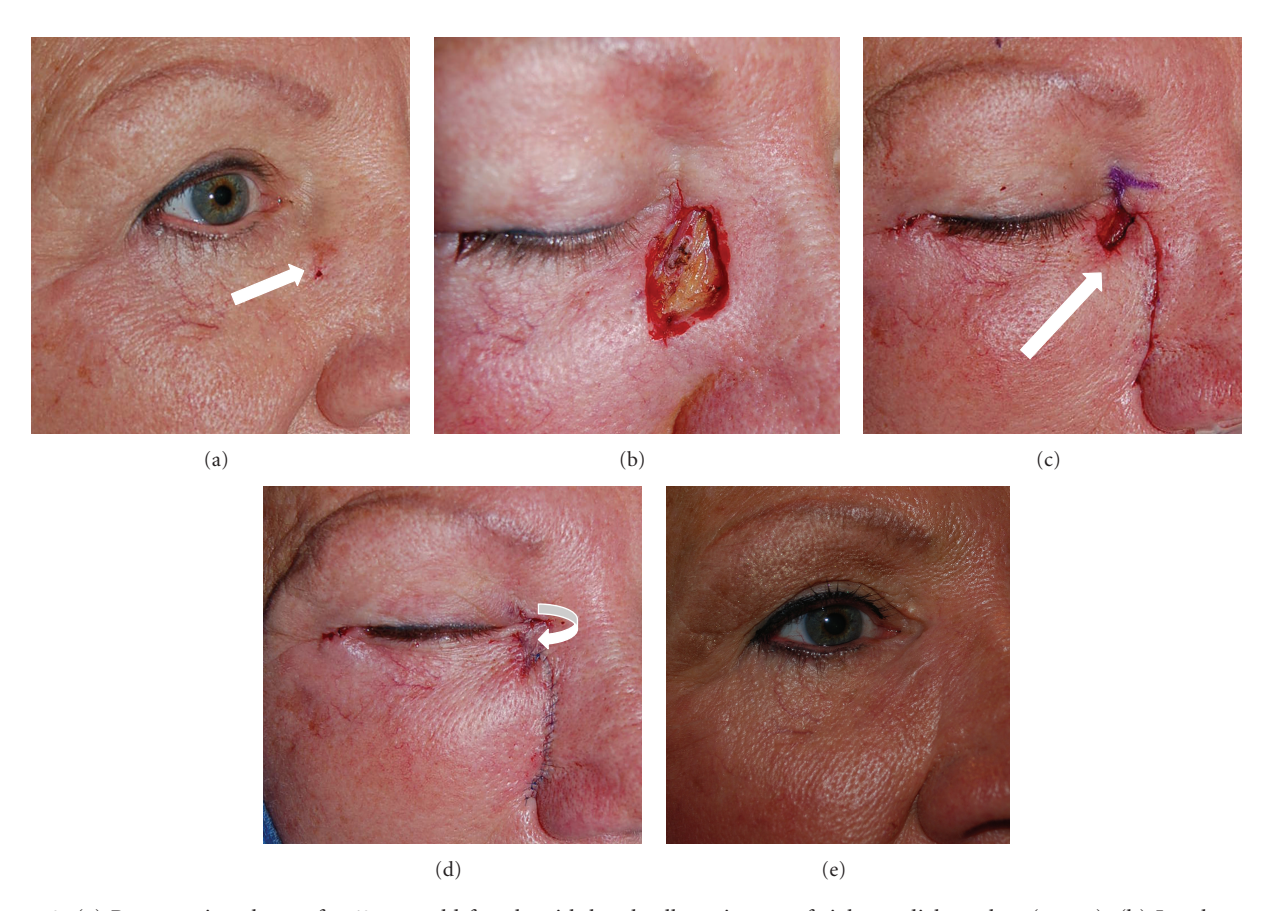
FIGURE 2: (a) Preoperative photo of a 62-year-old female with basal cell carcinoma of right medial canthus (arrow). (b) Local resection creating a 1.5 \times 2.0 cm defect. (c) Adjacent tissue transfer flap created via an infraciliary incision and relaxing incision at the lateral aspect of the nose. The flap is then advanced superiorly and medially (arrow) to fill in approximately 85% of the wound. (d) A small rhomboid flap is elevated from the upper lid and rotated inferiorly to fill in the remaining wound (arrow). (e) One year postoperative.