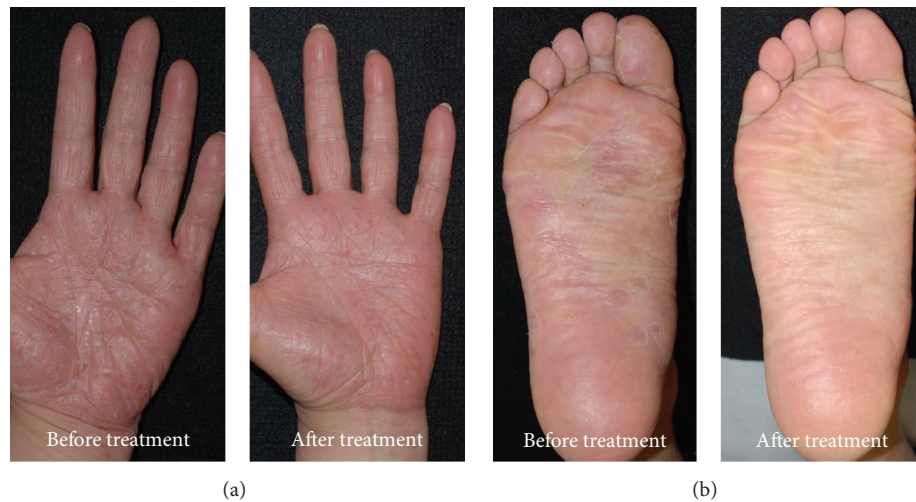
FIGURE 1: (a) Case 1. Multiple pustules over the left palm with scaling and erythema were markedly improved after 6-week treatment. (b) Case 7. Hyperkeratotic lesions over the right sole disappeared after 4-week treatment.

of all patients was 8.34 \pm 9.00 before JHT treatment. Four or 8 weeks after the administration of JHT, the average PPPASI significantly decreased ( 5.46 \pm 7.02 , p < 0.01 ; Figure 2). No adverse event was observed during the study period.