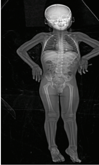
FIGURE 5: Paediatric full-body X-ray image showing superior imaging of the major airways.

patients. Its lower dose and fast imaging time (requiring less time for the patient to be still) is uniquely suited to paediatric orthopaedic studies. The Lodox system has been found to be useful in the assessment of nonaccidental injuries, bone dysplasia, and leg length discrepancies [41]. The Lodox viewing software, which allows distortion correction and accurate geometric measurement, has been shown to have higher interobserver reliability than previously recorded, which gives it the potential to assess and document a variety of nontraumatic paediatric pathologies [21, 27].