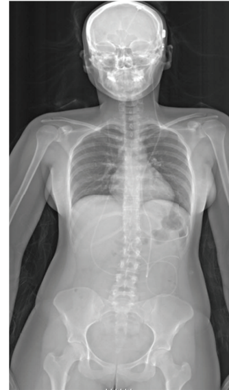
FIGURE 1: Lodox radiograph showing a ventriculoperitoneal shunt.

3.1. Ventriculoperitoneal Shunts. Ventriculoperitoneal (VP) shunts are commonly used to treat hydrocephalus in adults and children. Despite improvements in the use of VP shunts, there is still a very high rate of complications [12, 13]. Patients are prone to a varied range of malfunctions including obstruction, rupture, disconnection at a junction,