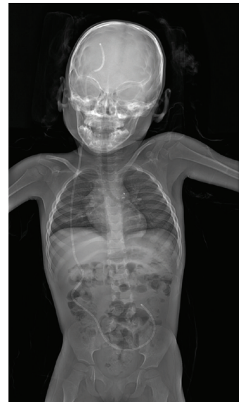
FIGURE 4: Example of the use of Lodox in VP shunt visualisation in paediatric patients.

In their pilot study on the use of the Lodox Statscan at the Red Cross Children’s Hospital, Pitcher et al. note the modality’s superior ability to visualise the three major airways in children [21]. A further study on erect chest radiography in the same institution on 33 children confirmed