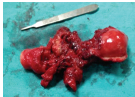
FIGURE 3: Total abdominal hysterectomy specimen.

defined clearly so far and there is no treatment approach that is obviously without risk [7]. Although the traditional management includes immediate definitive surgery consisting of cesarean hysterectomy, it may be associated with significant blood loss and injury to urinary tract with extended and complicated postoperative course. Also, massive transfusion and sometimes partial cystectomy may be required during such an approach [3]. According to a review of the literature, when hysterectomy is performed at the time of delivery, morbidity includes urologic complications in 72%–81% of cases and partial cystectomy in 40% [2]. In cases with antenatal diagnosis, planned preterm cesarean hysterectomy with the placenta left in situ may be performed following the transfer of patient to a tertiary perinatal care center [8]. Thus, extreme blood losses and neighboring organ injuries may be avoided [9, 10]. However, this management is possible only with antenatal diagnostic confirmation which may be achieved effectively by gray scale ultrasound [8]. On the other hand, diagnosis may be difficult in less severe cases and in cases without risk factors. Furthermore, increasing incidence trends and desire for future fertility warrants more conservative management options. Especially in cases with percreta invading adjacent organs, mortality and morbidity may be reduced when the patient is managed conservatively [11].