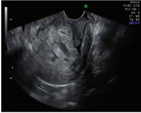
FIGURE 1: Ultrasonography showing soft tissue density with irregular contour in the endometrial cavity.