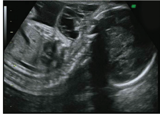
FIGURE 2: Ultrasound image at 26 weeks' gestation of a cervical teratoma.

The patient was a 33-year-old who was detected to have a right-sided, unilateral 5 cm neck mass at a 30-week scan. This extended posteriorly up to the cervical spine. The mass had thin walls with solid areas present and few echogenic areas (Figure 4). Vascularity was not increased. The amniotic fluid index was 11 cm. Our provisional diagnosis was a possible teratoma, lymphangioma, or neuroblastoma as the location and nature of the mass made the diagnosis of a thyroid lesion or cystic hygroma unlikely. The mass was stable with no development of hydramnios in subsequent scans. The patient underwent an elective Caesarean section at term. The mass was excised postnatally and histologically it was a lymphangioma.