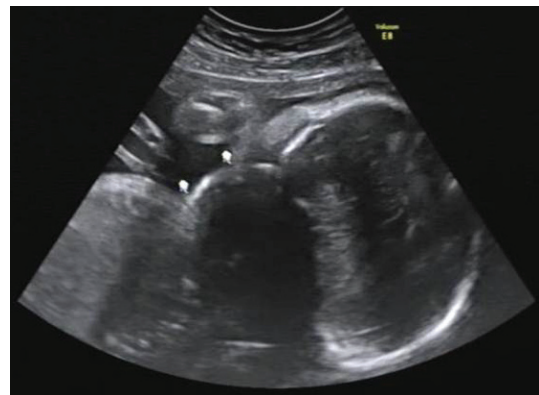
FIGURE 4: Ultrasound image at 30 weeks' gestation of a lymphangioma.