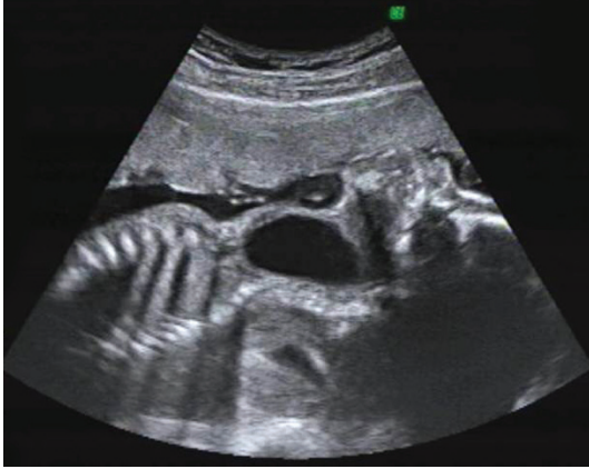
FIGURE 1: Ultrasound image at 27 weeks' gestation of a bronchogenic cyst.

well-defined borders and no increased vascularity (Figure 2). An epignathus was excluded as the tumour was not arising from the mouth. The amniotic fluid index was normal at 14 cm. The diagnosis then was a cervical teratoma. The patient delivered via elective Caesarean section at term. A teratoma was confirmed postnatally after surgical excision.