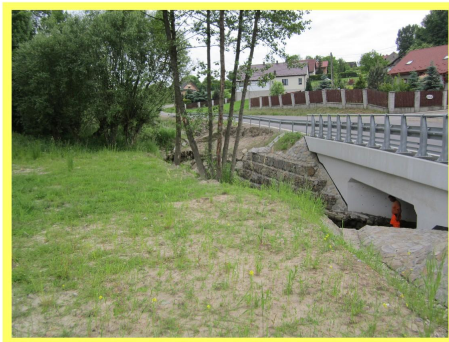
Fig. 3. Culvert on the upstream side and the view of damages