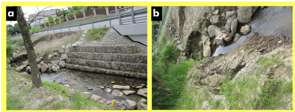
Fig. 4. The view of damages that occurred after the first year of exploitation a) from the downstream side and b) upstream side

In the first year (2015) after the construction was finished the bank protection on the right side formed from riprap slid along with the soil from the slope fig. below.