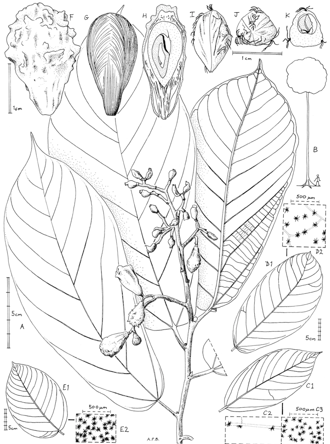
Figure 1 Microcos magnifica . (A) habit, fruiting branch; (B) habit sketch; (C) leaf variation: Etuge 2686: hairs on upper surface (left); hairs on lower surface (right). (D) leaf variation: Elad 118, with detail of hairs on lower surface; (E) leaf variation: Cable 2806, with detail of hairs on lower surface; (F) fruit, side view; (G) fruit, left with pericarp removed exposing mesocarp fibres; right longitudinal section (endocarp stippled, endosperm densely stippled), (H) endocarp, left, side view; right, distal end view; (I) endocarp with seed, transverse section. (A, C, F–K) from Etuge 2686; (B) from field observations of Cheek 12980; (D) Elad 128; (E) Cable 2806. All drawn by Andrew Brown.