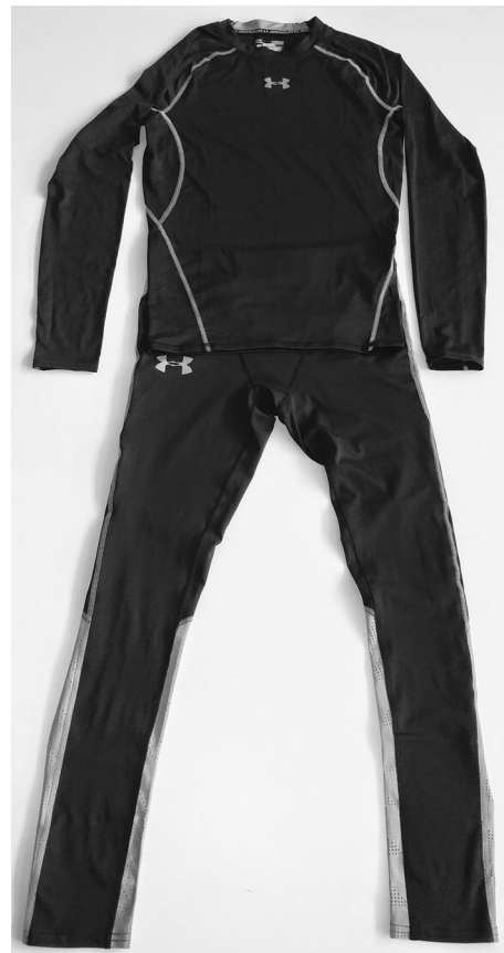
Fig. 1 Compression garment worn by the Paralympic athletes

Unloaded vertical jumping ability was assessed using SJ, which started from a static position with a 90° knee flexion angle maintained for 2-s prior to a maximal jump