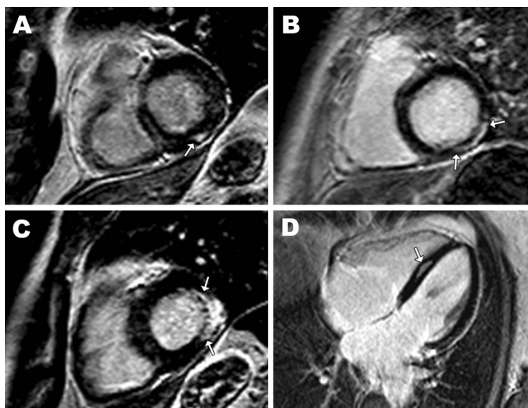
Figure 2 Myocardial fibrosis in myotonic dystrophy type 1 by CMR. Late gadolinium enhancement (LGE) images in short axis (A, B and C) and 4-chamber long axis views (D) of 4 patients with myotonic dystrophy type 1. Between arrows are regions of increased signal intensity, indicating focal fibrosis, visible as mid-myocardial enhancement to epicardial enhancement with endocardial sparing.

Increasing age, male sex and ECG conduction abnormalities are all significantly associated with myocardial disease, whereas CTG repeat length and severity of muscular impairment are not. Male gender and age have been positively associated with arrhythmia and conduction abnormalities [28]. There is no consensus from the literature as to whether or not CTG repeat size has value as a prognostic indicator of conduction disturbances or cardiac events [28-30]. While age at onset of symptoms and severity of the phenotype correlate with the size of the CTG repeat, the association between the length of the CTG repeat measured in leukocytes and other symptoms of MD1 is more elusive. The heterogeneity of symptoms shown by patients with similar CTG repeat sizes can partly be explained by the presence of somatic mosaicism and somatic expansion over time [31].