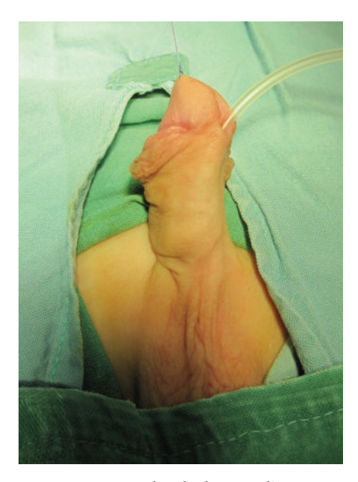
FIGURE 1: Glanular hypospadias.

Group II: patients with hypospadias not standardly tested for curvature, treated by the second group of surgeons.