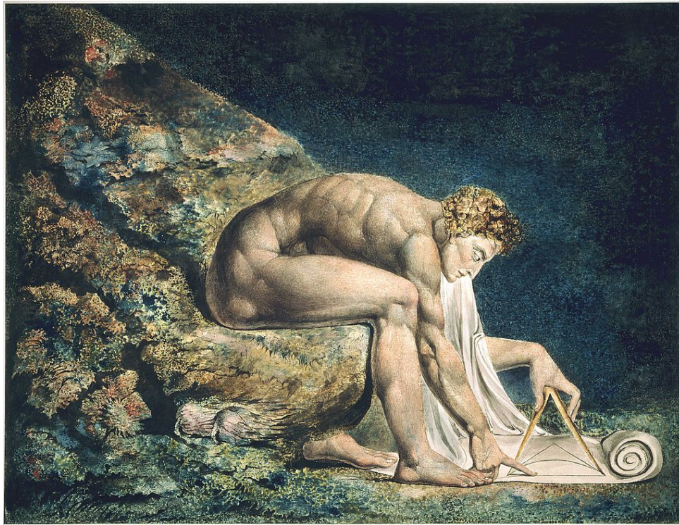
Figure 3: 'Newton' by William Blake (1795). Photographic reproduction of a two-dimensional, public domain work of art housed in the Tate Gallery, London, UK.

relationships with the diverse entities we share life with is most urgently needed. 18 As Joronen (2013: 635, 633) writes, this particular "ontological mono-politics of calculative enframing" "turns the world into a calculated picture denying what remains most essential for the earth: its openness for unpredictable emergence." In particular, the abstracting and calculative onto-epistemology of modern environmental accounting rigidifies the veil between 'us' and 'nature': an act depicted so well by William Blake in his 1795 iconic image of Isaac Newton turning his back on the immanent and animate complexity of the natures from which his will to abstract the laws of nature derived (see Figure 3). 19