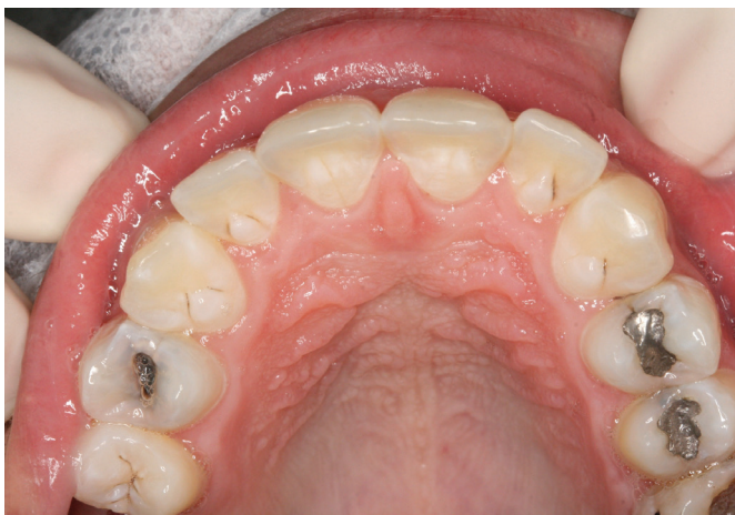
Figure 1. Intraoral view of the maxillary showing the talon cusps on the palatal surface of the six anterior teeth.

Panoramic radiographs showed V-shaped radiopaque structures on the central incisors, lateral incisors, and canines, superimposed over the normal image of the crown (Figure 2). The clinical and radiographic features suggested the diagnosis of talon cusps.