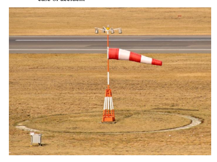
Figure 1 – Source of meteorological information

d) initiating and assistance for search and rescue team in case of accident