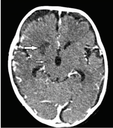
FIGURE 2: Enhanced brain computed tomography scan nine days after admission. Axial image through the basal ganglia shows hypodensities involving the right head of the caudate and anterior aspect of the putamen (thick white arrow) as well as the right hypothalamus (thin white arrow) representing subacute infarcts. In addition, there is development of bilateral hemispheric hygromas.