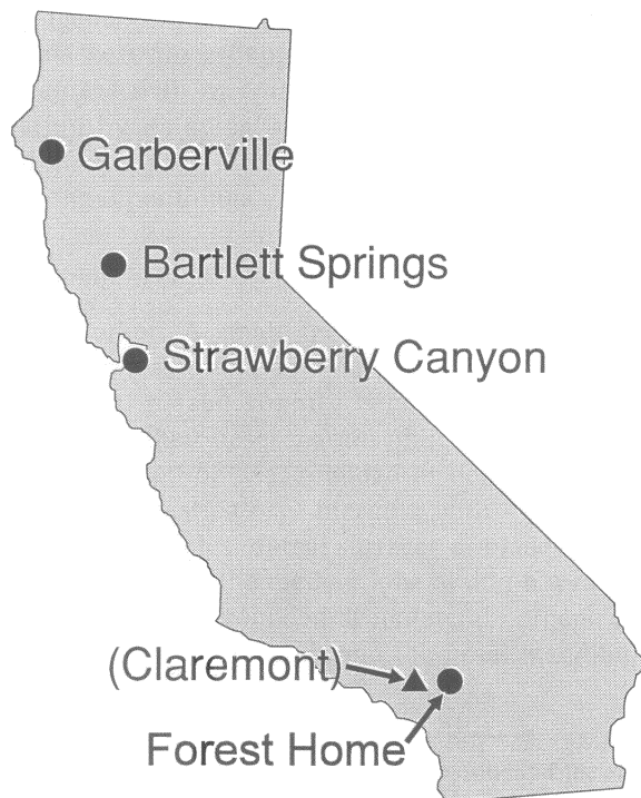
Figure 1. Collecting sites in California of the “ C. mohave ” yellow-green color variant of Chrysoperla johnsoni and C. downesi . Claremont, marked with a triangle, is the type locale of C. mohave (Banks).

Collection and Rearing: Living adults of C. mohave were collected 20–28 September, 1987, from three relatively hot, dry sites in California, covering a north-south range of nearly 1000 km (Fig. 1). Those referred to as “Garberville” were found on the evening of 20 September in mixed stands of young Douglasfir and scrub live oak along a side street of Garberville, California, elevation \approx 280 m, about 22 km southeast of the Humboldt Redwoods. “Bartlett” specimens were obtained 21 September near the transition from desert to forest, elevation \approx 1000 m, in an open area of