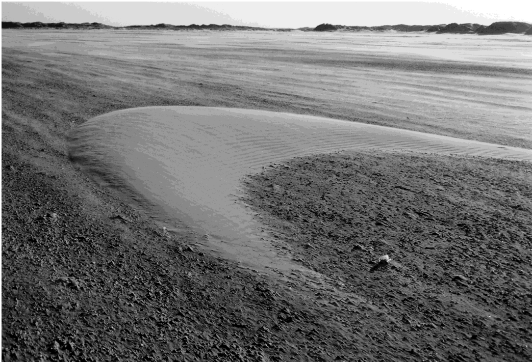
Figure 2. Oblique view of a crescentic dune illustrating the crescentic barchanoidal plan shape, steep asymmetric windward slope, low, long leeward slope, straight-crested normal ripples, and dune horns