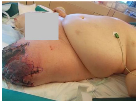
Fig. 1 Status post recent amputation of the right leg; ongoing necrosis of the left leg despite amputation 5 days before.

Despite interventional thrombectomy and fasciotomy, amputation of the left leg had to be performed 2 days later. On day 15 after hip surgery, thrombosis of the right vena poplitea and vena femoralis superficialis required interventional thrombectomy and fasciotomy. However, this did not prevent from amputation because of ongoing