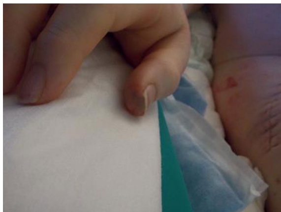
Fig. 2 Acral necrotic spots.

Throughout a 30-days stay at the intensive care unit, hemodynamic and respiratory parameters stabilised and the patient regained renal function. Moreover, platelet count normalized (Fig. 3). Due to essential repetitive surgical interventions, administration of Argatroban had to be continued for at least 38 days because of—compared to vitamin k inhibitor—better perioperative controllability. Therapy with Argatroban was switched to Phenprocoumon (Marcoumar ® ) afterwards according to current bridging guidelines. The patient could be transferred to the normal ward and further rehabilitation.