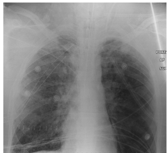
Figure 2 Chest X-ray 48 hours after intensive care unit admission. We see a clear improvement, with decreased bilateral infiltrates, compared with previous X-ray.