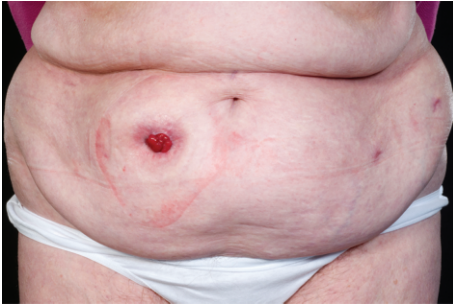
FIGURE 2: The cosmetic benefits of RARC with RICIC in a female patient two months after surgery. The specimen was retrieved through the vagina during the operation.