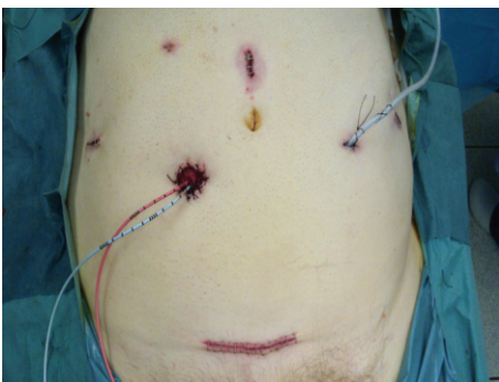
FIGURE 3: The cosmetic benefits of RARC with RICIC in a male patient immediately after surgery. The specimen was retrieved through a mini-pfannenstiel incision.

discharge and recovery, and higher patient satisfaction [8–10]. Figure 2 shows the cosmetic benefit of RICIC in a female patient. Figure 3 shows the cosmetic appearance in a male patient following a robotic cystoprostatectomy. One of the difficulties in establishing any benefit for RICIC is that radical cystectomy is a morbid operation, performed on a patient population prone to comorbidity with a high complication rate—regardless of whether this is done open or robotically. Many of the complications are due to the cystectomy and extended pelvic node dissection, which is performed the same in both RARC and RARC with RICIC.