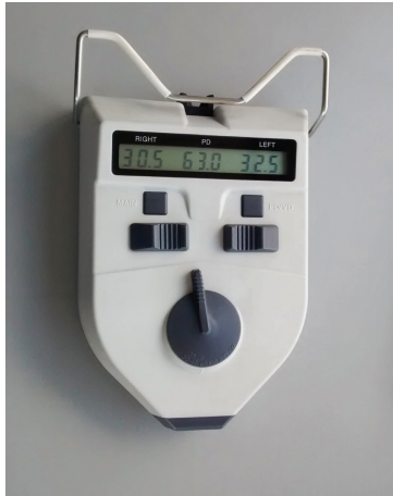
FIGURE 1: Digital pupillometer that shows in the center the ID and to the sides the NPD of each eye.