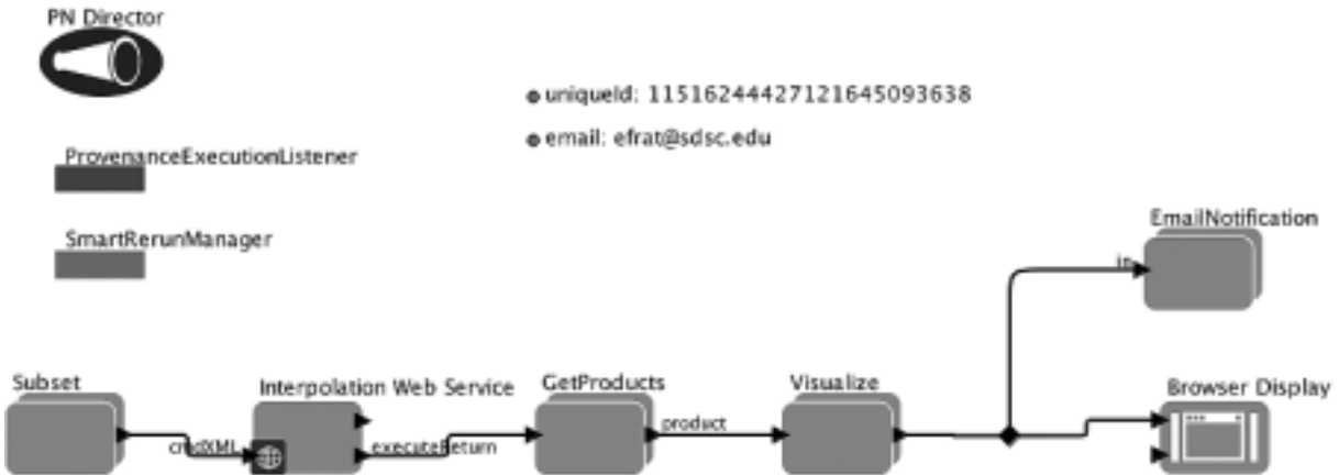
Fig. 2. An executable workflow instance example created on the fly from the workflow template based on the user selections.

reusable building block components. The LiDAR processing workflow, depicted in Fig. 1, provides a conceptual workflow where each of the components can be dynamically customized by the availability of the data and processing algorithms and is set on the fly prior to the workflow execution (Fig. 2 gives a snapshot of the top level of an instantiated workflow instance). This modularized approach can be captured as a workflow pattern of subset , analyze , and visualize . Below we elaborate on each of the processing steps.