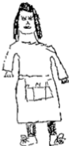
Figure 3. Fifth-grader's drawing of a scientist.

chemical spills or harm by poisons. The coat usually contained several pockets in which the scientist could put pencils or test tubes. In the fifth-grade class, 4 showed a scientist with a lab coat; 2 showed glasses; and 4 included a lab setting with beakers, test tubes, and clipboards. Only one drawing showed a scientist doing field work—digging dinosaur bones at an archeological site.