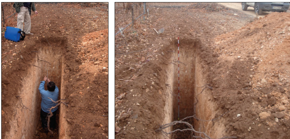
FIGURE 2: Sampling process in P4.

samples was carried out with pearls of lithium borate. Quality control was evaluated by duplicate analysis of certified reference samples (BCR 62, SMR 1573, and SMR 1515).