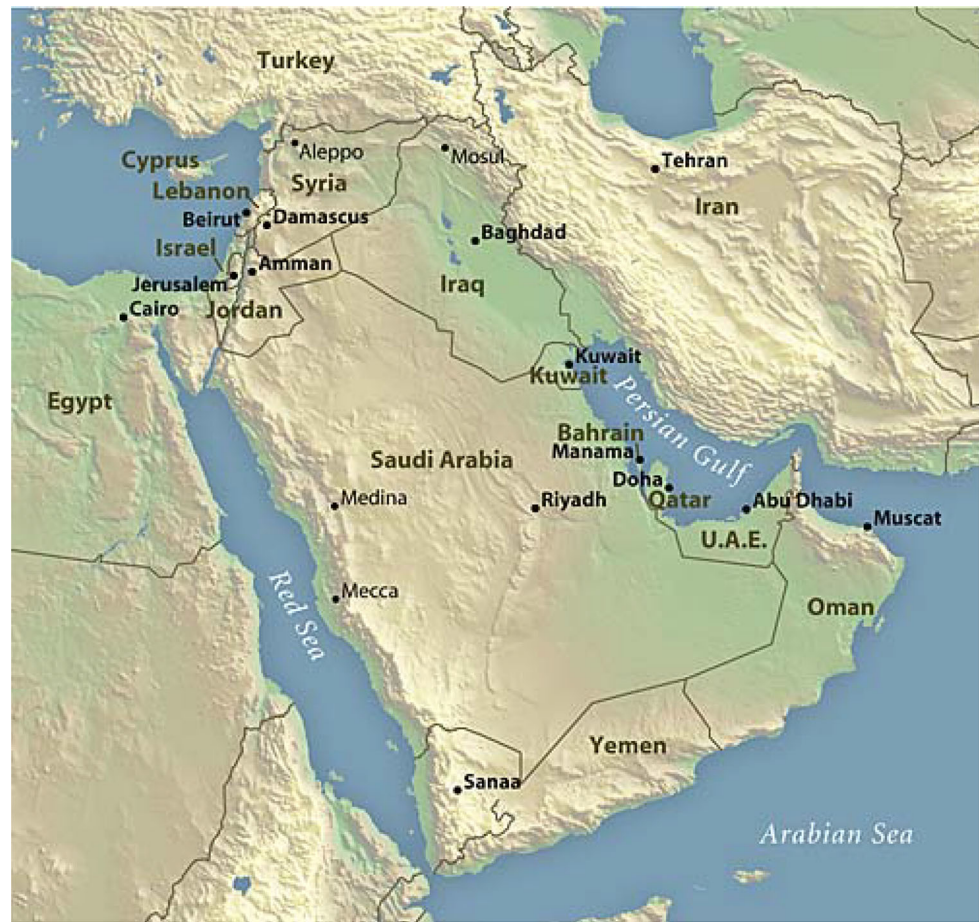
Fig. 1 Map of the Arabian Peninsula