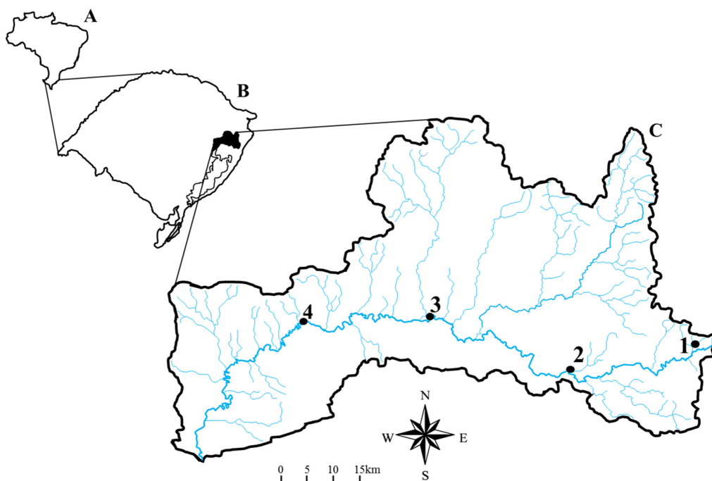
Figure 1. Location of water sampling points in the municipalities of Caraá (1), Santo Antônio da Patrulha (2), Taquara (3) and Campo Bom (4) in the Sinos River Basin (C), state of Rio Grande do Sul (B), Brazil (A).

This study was conducted in the Rio dos Sinos that is located in the east of the state of Rio Grande do Sul (29° 20' to 30° 10' S and 50° 15' to 51° 20' W), in southern Brazil (Figure 1), for a period of 24 months.