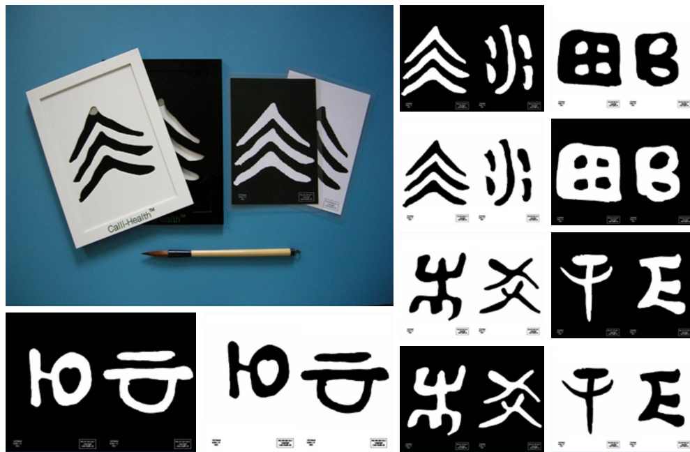
Figure 1 Some of the special characters and the design of the writing plates with grooved characters.

total of 10 character finger writing were performed for each training session. The schedule included 3–5 sessions per week and 4 weeks per month.