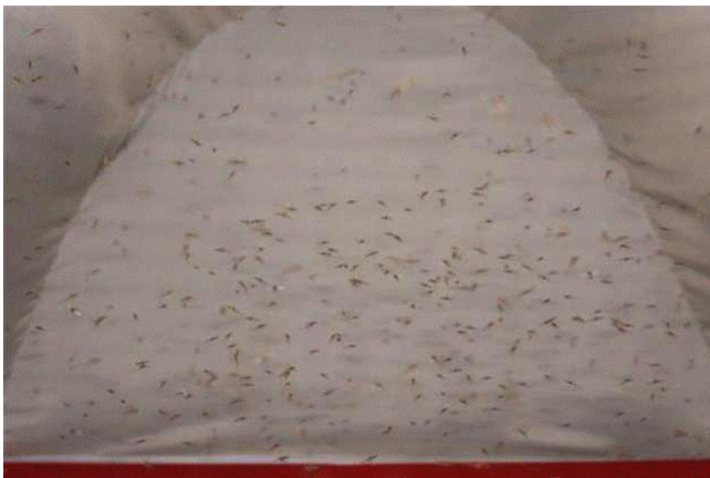
Figure 3 Adult An. arabiensis swarming. The effectiveness of the artificial horizon in the cage shown in Figure 2 is seen by swarming occurring during an artificial dusk.

In previous mosquito release programmes, measures for disease control have been conducted without knowledge of potential pathogens in the colony. Given the paucity of information, past experiences with pathogens in mosquito mass-rearing systems are encouraging. For instance, mass rearing of An. albimanus in the early stages in El Salvador was fraught with a high number of "bad trays" (10%-16%) from which few or no pupae were harvested. Often these trays exhibited lack of synchrony in development and foul-smelling water suggesting that improper amounts of diet were provided. Later, when the rearing was increased to one million male pupae per day, losses were reduced to around 1%. In both circumstances, eggs were cleaned simply by washing with water, which apparently sufficiently reduced Nosema and/or other surface contamination.