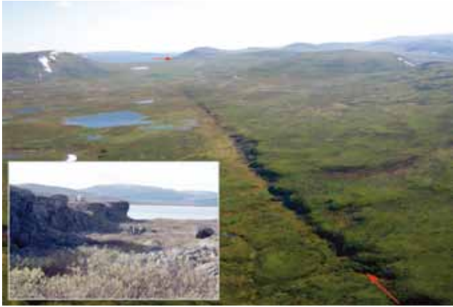
Figure 2. Helicopter view of the southwestern part of the Pärvie PG fault (see Fig. 1 for location). The red arrows show the trace of the fault scarp. The insert shows the fault scarp from the ground surface, about 85 km to the northeast of the location of the large photo, including a helicopter for scale.

Methods applied in PG fault research so far include bedrock and Quaternary field geology, trenching, seismicity, airborne and ground geophysics, and shallow drilling to about 500 m (Kukkonen et al., 2010). Revealing the mechanisms and processes related to PG faulting is highly relevant for understanding seismicity in these intraplate areas. Several disciplines and approaches can be used to improve our understanding of PG faults, for example, through earthquake seismology, stress field measurement and modeling, as well as geodetic surface monitoring of fault activity. Scientific drilling and coring is the only way to obtain direct core samples from PG faults at depth, and the resulting boreholes provide direct access to the fault structures for geophysical, hydrogeological, and biological sampling, monitoring and in situ experiments. We organized the ICDP-supported international workshop “Postglacial Fault Drilling in Northern Europe” in Skokloster, Sweden on 4–7 October 2010; thirty-nine participants represented basic research, applied geosciences, industry and authorities from eight countries. At the workshop, the status of PG fault research was discussed, and plans were made towards developing a realistic drilling plan.