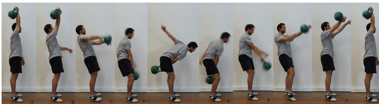
Figure 1 Illustrates the phases of the kettlebell snatch. (A) fixation, (B) drop, (C) re-gripping, (D) back swing, (E) forward swing, (F) acceleration pull, (G) hand insertion, (A) fixation.