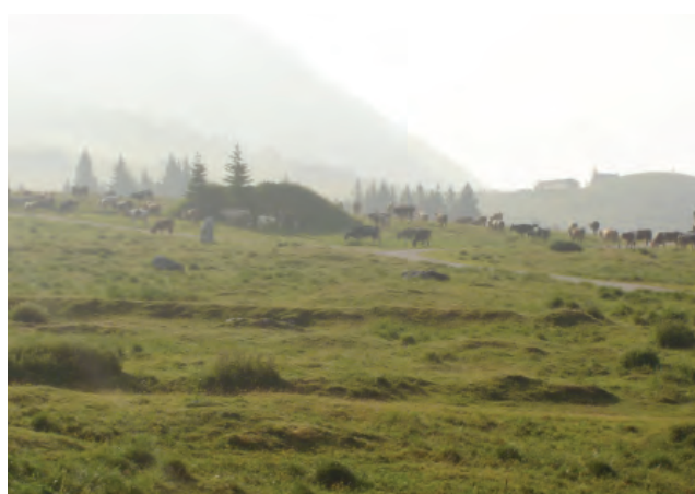
Figure 7. Grazing animals in the Alps. (Photo by Simona Rainis, 2010).