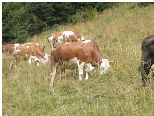
Figures 8. Cows grazing in pastures that are difficult to be mowed.

The chain Carne della Montagna-Carne di Qualità was created on the basis of a specific stakeholder's will, in order to start a program able to valorize first of all the mountain environment and its highly valued resources. The fundamental aim is to re-evaluate a low exploited territory with its typical goods (Zanetti, 2007). The present project is char-