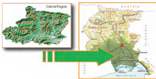
Figure 2. Carnia Region, in Friuli Venezia Giulia.