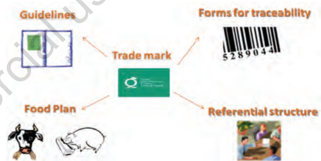
Figure 3. Characteristic elements of the Carne della Montagna Friulana-Carne di Qualità chain.

Animals, as regulated in the guidelines, have to be fed with local forage (at least 50%), and with a physiological diet which guarantees good quality meat. During the finishing phase, the calves received a ration constituted by raw materials, almost exclusively, produced in this farm. For the porcine meat, a stock farm defined as a Pilot Farm by the UE Commission, for the Pig Genetic Qualification Research Scheme was chosen. The breeding rules, the nutrition and the swine races are the same as specified in the Control System of the DOP Prosciutto di San Daniele , as reported on the Official Journal of the