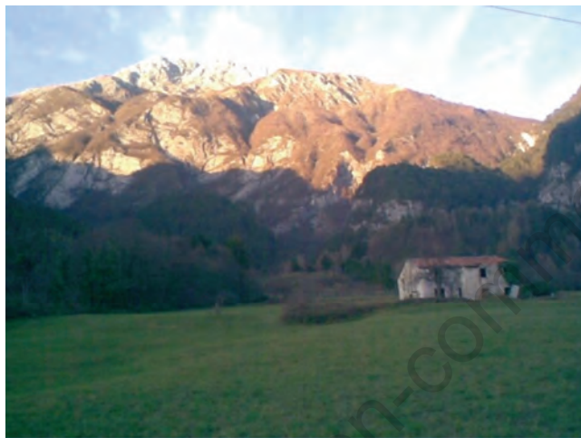
Figure 1. Monte Amariana in Carnia-UD. (Photo by Chiara Betti-ga, 2010).

The stakeholders (breeders, slaughterhouses, traders and the institutions) subscribed a chain agreement, adopting production guidelines (where a rigid food plan and all the modalities for the transparency and traceability of the production process are clearly specified) and a commercial trademark (Figure 3).