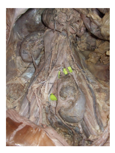
Rt: right Lt: left RA: renal artery RV: renal vein