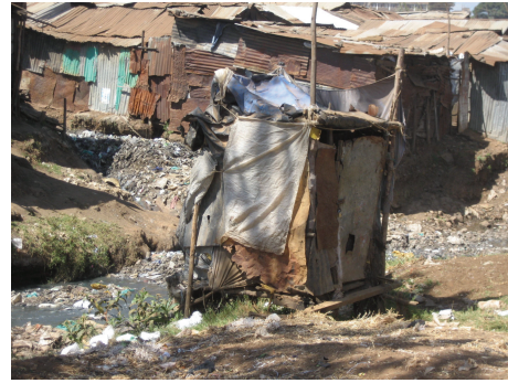
FIGURE 2: Typical Mathare toilet.

According to a study in Nairobi's Kibera slum, over 36% of slum dweller women report being physically forced to have