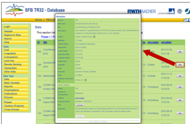
Figure 4. Request on type 'data' with metadata info window

keywords, creator, and regions/sites. As result of all searches by the web-interface, a list of datasets will be displayed (Figure 4).